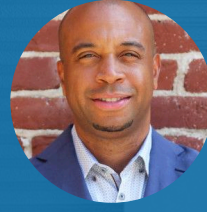
E.A. Rockett Adobe